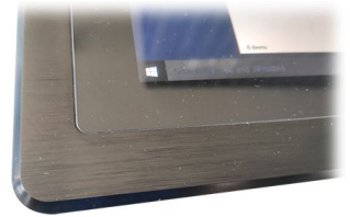
Slim, aesthetically pleasing frame for professional integration and finish

17" capacitive multi-touch technology touchscreen monitor and ruggedised fanless computer in brushed aluminium chassis. Passive cooling system without the use of fans. Protected against water from the front, IP65 protection on the front. High brightness 1000 nits screen with optical treatment to be readable in the sun and improve its protection. Wide voltage range of 9V-36V.