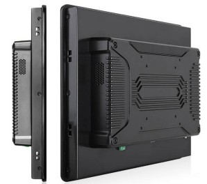
professional integration and finishing

21.5" multi-touch capacitive technology touchscreen monitor and fanless ruggedised computer in brushed aluminium chassis. Passive cooling system without the use of fans. Front waterproof, IP65 protection on the front. High brightness 1000 nits screen with optical treatment to be readable in the sun and improve its protection. Wide voltage range of 9V-36V .